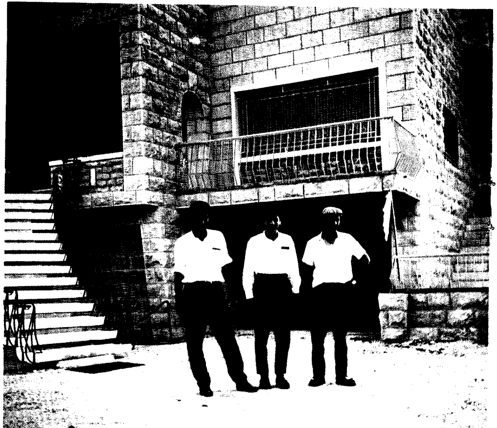
Right: View of our Jerusalem office-home combination — still in perfect condition.